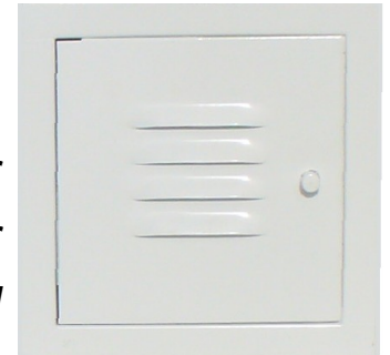
Access Panel with Louvered Door In Optional White Color Model TMV-1212C-W