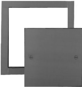
Access Panel with Removable Door Model TMZ-1818RD