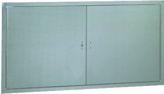
Double Door Access Panel Shown In Optional Stainless Steel Finish Model TMS-3626CDD