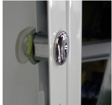
SAF-T-LOK™ In Locked Position